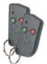
On/Off remote controls and wireless accessories