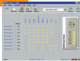
PSA Connect Software & Modem