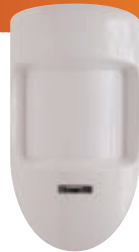
Complete range of PIR Sensors