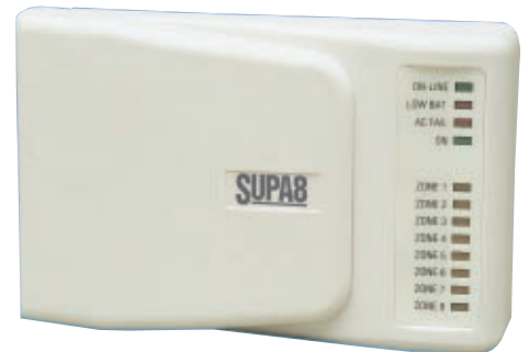
Supa8 Keypad (closed)