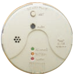
240V AC Smoke Alarm